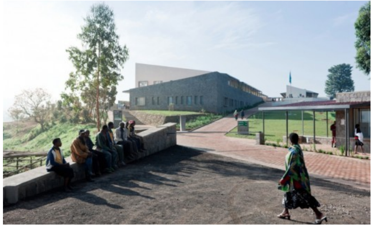
Butaro Hospital, Rwanda / MASS Design Group. "The Butaro Hospital in Rwanda's Burera District has 140 beds and serves 400,000 people."