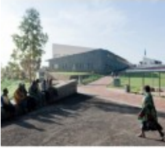
Butaro Hospital / MASS

Model of Architecture Serving Society — aka MASS Design —is a Boston-based architecture firm that has created a niche practice in designing healthcare facilities in resource-limited settings, primarily in countries emerging from crisis. MASS brings high-quality design and implementation to where it is most needed, and at the same time brings other disciplines into architectural work (its core team includes public health professionals with no background in design).